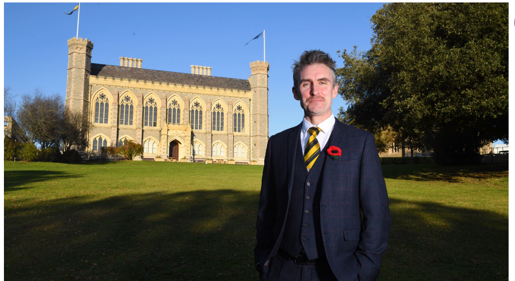
"It's such a wonderful community and school, and it is a huge honour to be given stewardship of it'